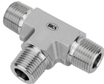
Tee Male Threaded

Material :- SS316 Sizes :- All sizes available , BSP/NPT Pressure :- upto 6K