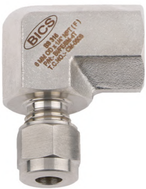
Female Compression Elbow

Material :- SS316 Sizes :- All sizes available , BSP/NPT Pressure :- upto 6K