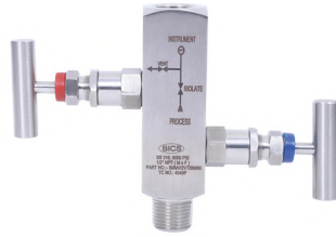
2 Way Manifold

Material :- SS316/Monel/Hasteloy C-276 Sizes :- 1/4", 3/8", 1/2", 3/4", 1" BSP/NPT Pressure :- 3K, 6K, 10K and 15K