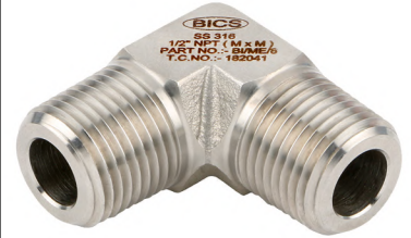
Elbow M/M Threaded

Material :- SS316 Sizes :- All sizes available Pressure :- upto 6K