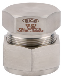
Compression End Plug

Material :- SS316 Sizes :- All sizes available Pressure :- upto 6K