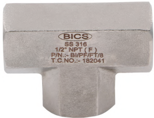
Tee Female Threaded

Material :- SS316 Sizes :- All sizes available , BSP/NPT Pressure :- upto 6K