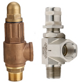
Safety Relief Valve

Body :- Stainless Steel Stem Length :- All sizes available Ranges :-All Ranges available Types :- Bottom, back & every Angle