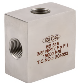
Elbow & Tee High Pressure

Material :- SS316 Sizes :- All Sizes available Pressure:- Upto 10K