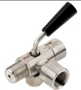
3 Way Ball Valve

Material :- Brass/SS316/Monel/Hasteloy Sizes :- All Sizes available Type :- Threaded/Flanged