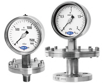
Diaphragm Pressure Gauge

Dial Sizes :- 2-1/2" and 4" Accuracy :- 0.25%, 0.5% Reading:- Bar, PSI, MPa, MBar