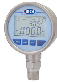
Digital Pressure Gauge

Dial Sizes :- 4" and 6" Body :- Stainless Steel Connection :- Stainless Steel