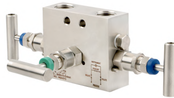
3 Way Manifold

Material :- SS316/Monel/Hasteloy C-276 Sizes :- 1/4", 3/8", 1/2", 3/4", 1" BSP/NPT Pressure :- 3K, 6K, 10K