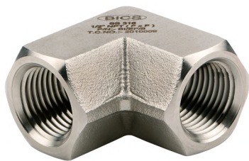
Elbow Female Threaded

Material :- SS316 Sizes :- All sizes available , BSP/NPT Pressure :- upto 6K