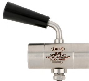
Gauge Cock Valve

Material :- Brass and SS316 Sizes :- All Sizes available Thread :- BSP/NPT