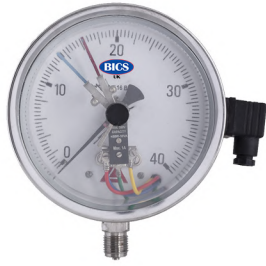
Electrical Pressure Gauge

Dial Sizes :- 4" and 6" Body :- Stainless Steel Connection :- Stainless Steel