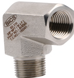
Elbow M/F Threaded

Material :- SS316 Sizes :- All sizes available , BSP/NPT Pressure :- upto 6K