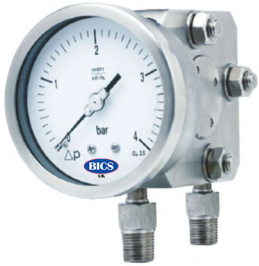
Differential Pressure Gauge

Dial Sizes :- 2-1/2", 4" and 6" Body :- Black/Stainless Steel Connection :- Brass/Stainless Steel