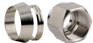
Ferrules and Nuts

Material :- SS316 Sizes :- All Sizes available Thread :- BSP/NPT