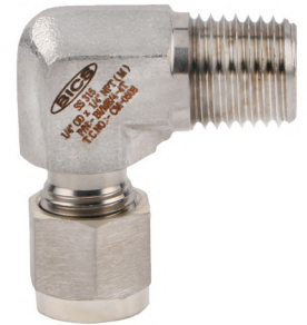
Male Compression Elbow

Material :- SS316 Sizes :- All sizes available Pressure :- upto 6K