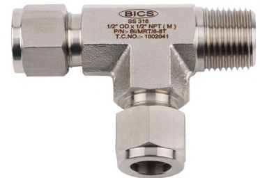
Compression Branch Tee

Material :- SS316 Sizes :- All sizes available Pressure :- upto 6K