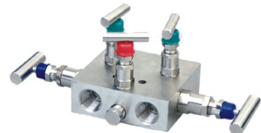
5 Way Manifold

Material :- SS316/Monel/Hasteloy C-276 Sizes :- 1/4", 3/8", 1/2" BSP/NPT Pressure :- 3K, 6K, 10K